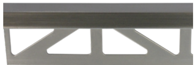
pro-part old iron