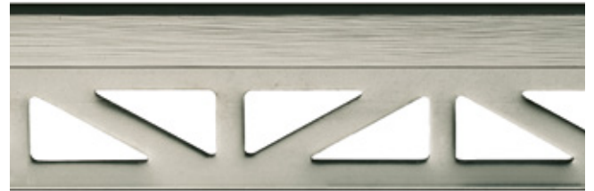
pro-part moon line