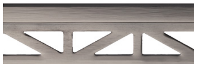
pro-part graphite matt line