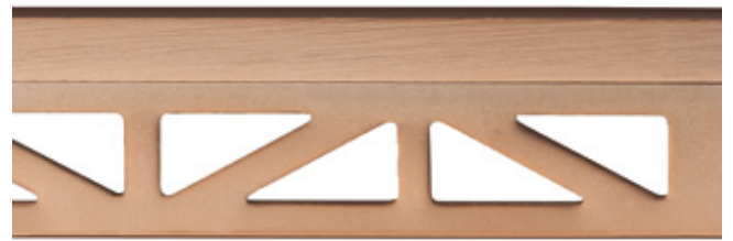
pro-part rose line