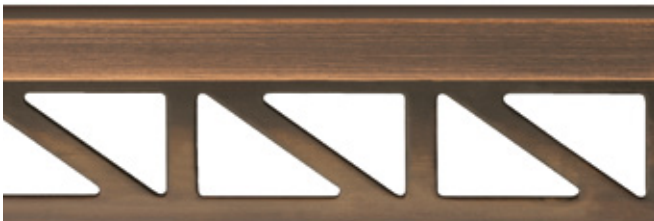
pro-part old bronze