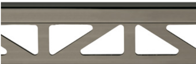
pro-part graphite matt