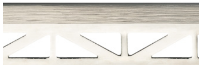
pro-part line matt